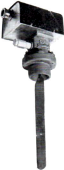
ABFS - 4 (0025)

The convertible paddle model is designed for handling various process fluids including corrosive ones with varying conditions of pressures and temperatures. The characteristics are field adjustable and can be adapted to any pipe size by just changing the paddle.