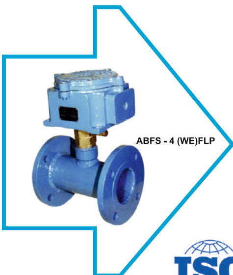
ABFS - 4 (WE)FLP

For the first time in India, Complete range of flow switches