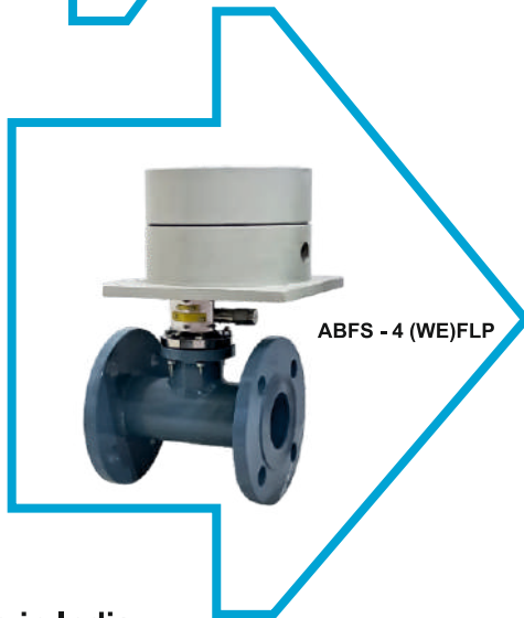
ABFS - 4 (WE)FLP

For the first time in India, Complete range of flow switches